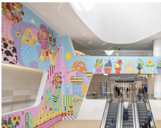
SFO – Terminal 1 Calderwood Public Art

SFO staff periodically develop and update a plan for redevelopment, improvement, and expansion of SFO facilities. The plan is reviewed and approved by the Airport Commission. Currently, capital reporting and spending is tracked to the SFO Capital Improvement Plan (CIP) totaling $11.0 billion, which was approved in October 2023. The CIP consists of: (1) the $8.0 billion Ascent Program – Phase 1.5; and (2) the $3.0 billion Infrastructure Projects Plan, previously referred to as the Rolling Capital Improvement Plan, which addresses both current emerging needs and those related to replacement of aging infrastructure. A major objective of SFO's current CIP is to position the Airport for projected passenger traffic growth and meeting demand-driven terminal gate needs. Other key CIP objectives include improving groundside access for passengers, enhancing safety