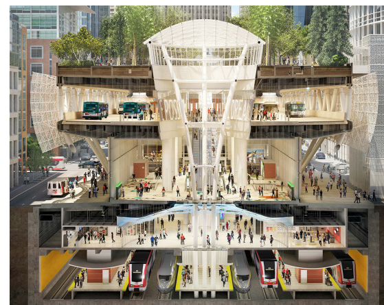
The Portal – Salesforce Transit Center

According to the U.S. Department of Transportation (DOT), SFO was ranked the ninth busiest airport in the United States in terms of enplaned passengers in FY2023, up from fifteenth in FY2022, and seventh in FY2019. It