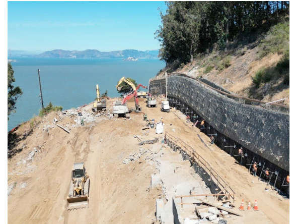
Yerba Buena Island Bridge Construction

This chapter summarizes SFMTA's capital needs at a high level. For a detailed description of SFMTA's capital projects,