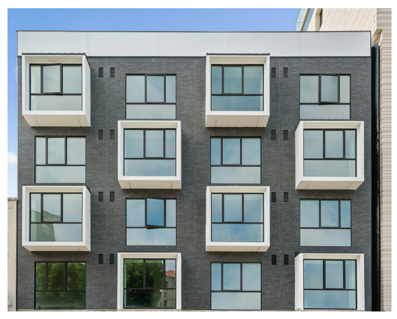
Permanent Supportive Housing at 42 Otis St