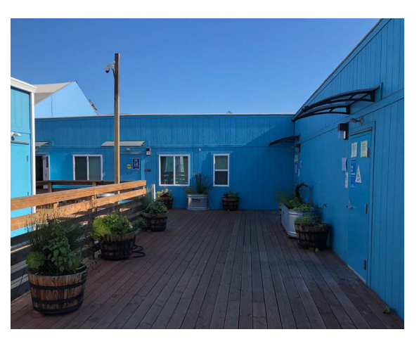
Division Circle Navigation Center