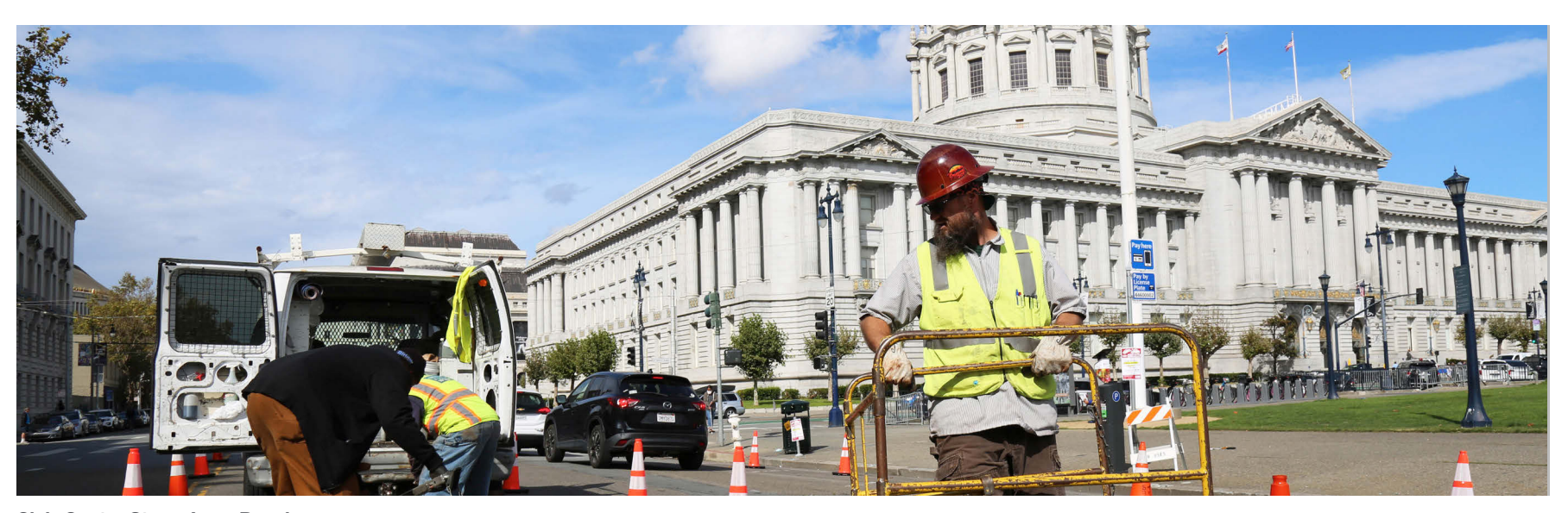
Civic Center Steam Loop Repair