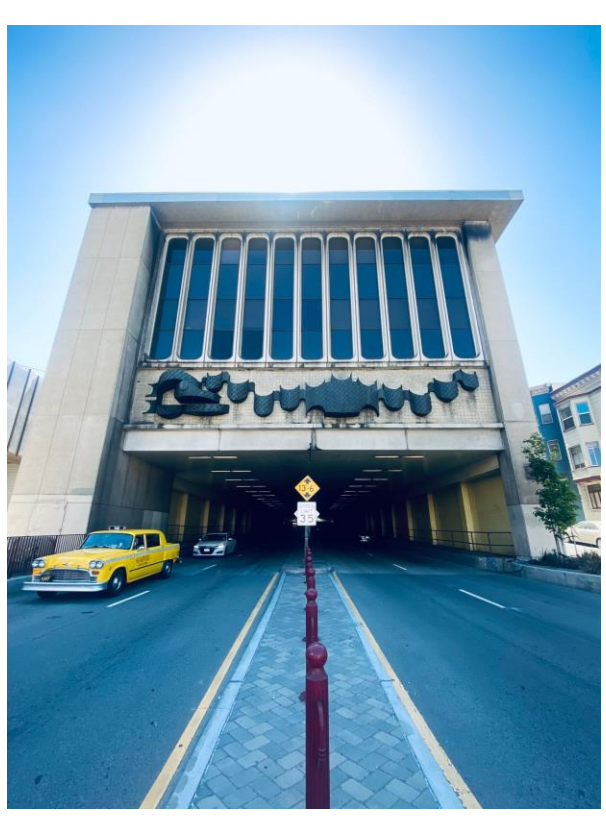
Highlighted Projects - FY26 Budget Request

Left to Right: Pioneer Monument, D5 ($380K); Longshoremen's Mural, D6 ($110K); Valencia Street Posts, D9 ($95K); Dragon Relief, D3 ($80K).