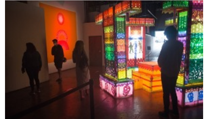
MISSION CENTER FOR LATINO ARTS EXHIBIT