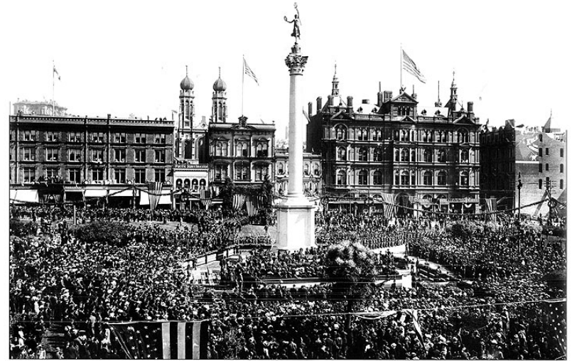
DEWEY MONUMENT - Union Square Perform Structural Assessment and Stabilization