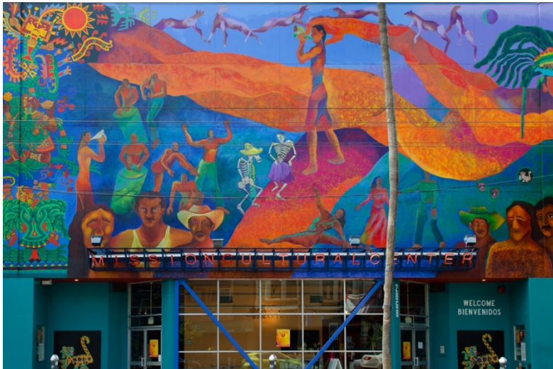
MISSION CENTER FOR LATINO ARTS – Mission District Unfunded balance of $10M for seismic upgrades