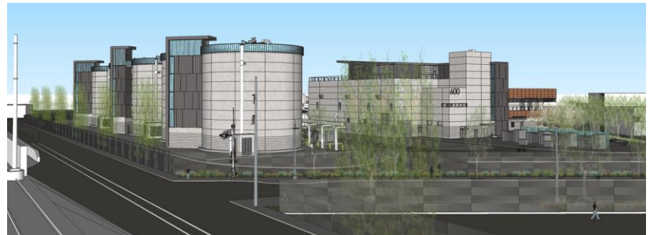
FY 21-22 WWE Capital Budget changes