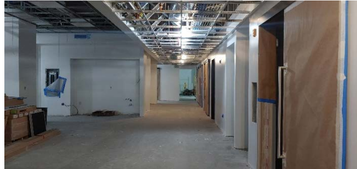
ZSFG Rehab – New Exam Rooms