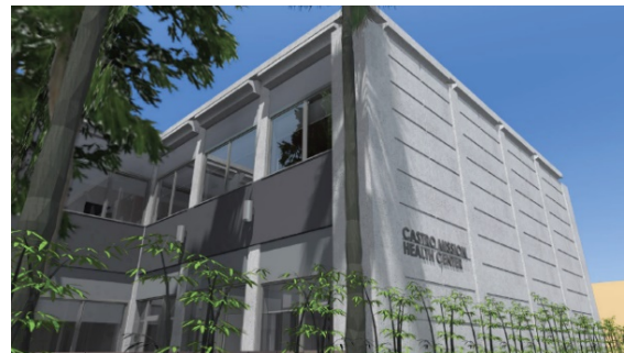
Castro Mission rendering