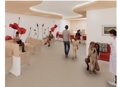
Family Health Center rendering