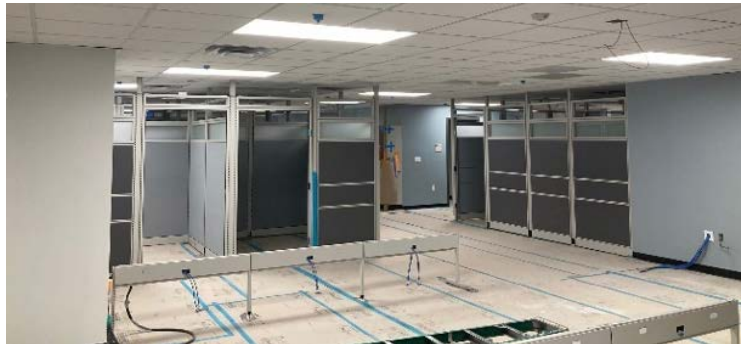
ZSFG 6H Surge – New workstations installation