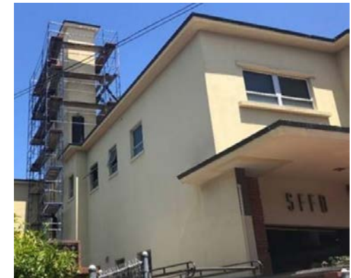
Fire Station - Seismic Hose Tower