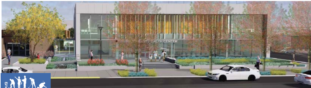
Southeast Health Center (rendering)