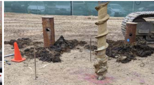
SEHC – Test Torque Pile