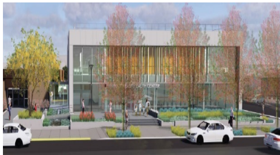
Southeast Health rendering