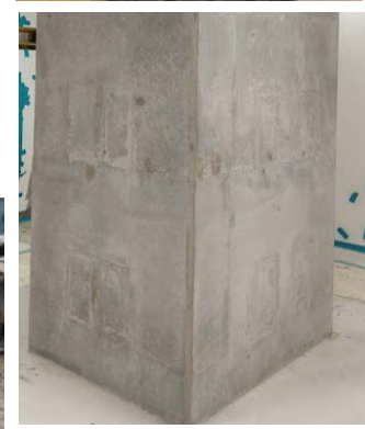
ZSFG Seismic – Column Strengthening