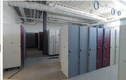
Ambulance Deployment Facility