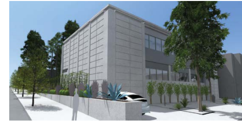
Castro Mission (rendering)