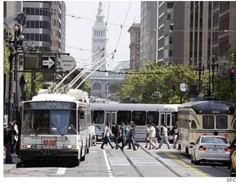
San Francisco Market Street