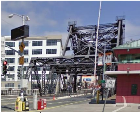
3 rd Street Bridge