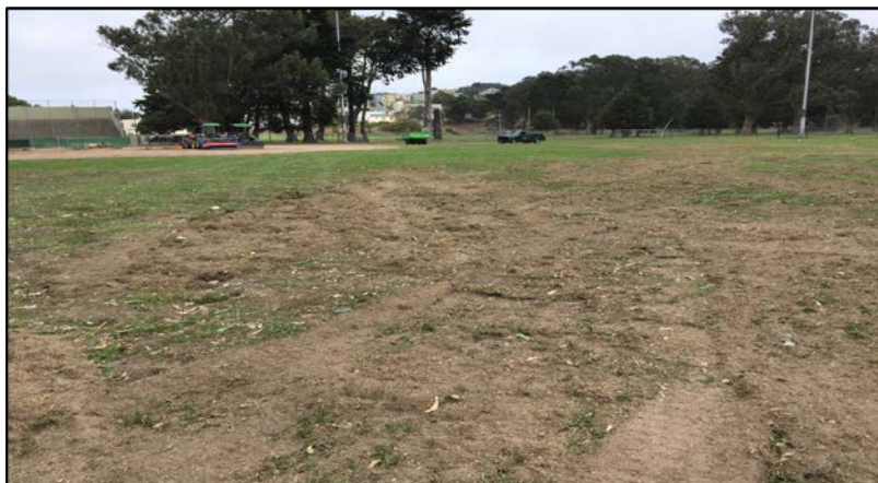
Crocker Amazon Turf Replacement – Before and After