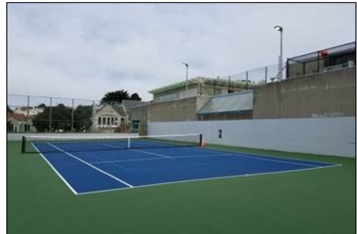
West Portal Playground Courts Resurfacing – Before and After