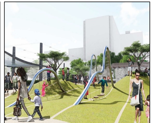
Portsmouth Square – Existing and Planned