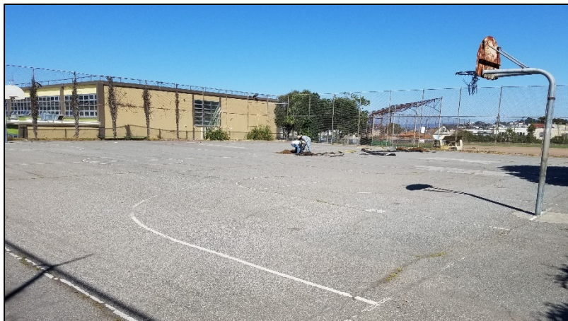
Alice Chalmers Courts Resurfacing – Before and After