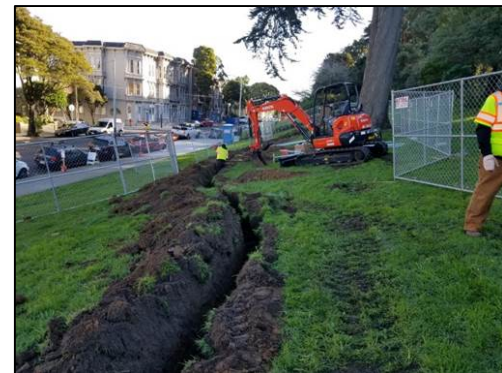
Buena Vista Park - Irrigation