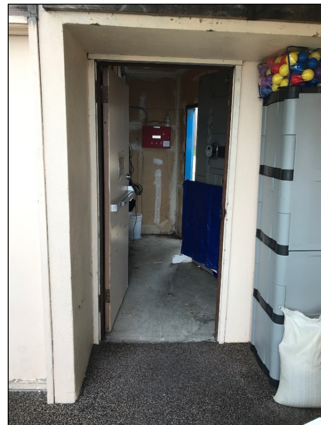
Current Fire exit from yard